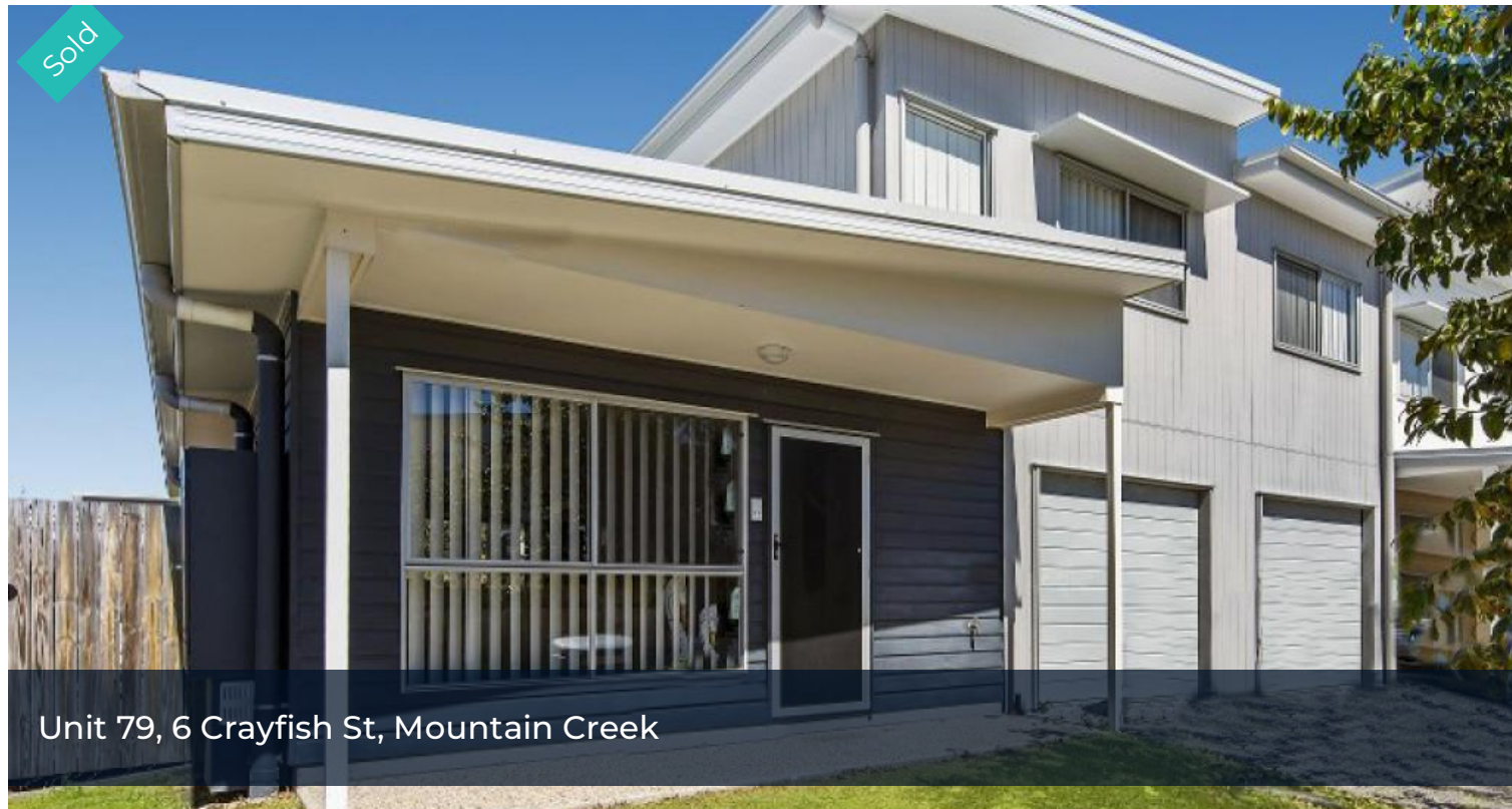
Unit 79, 6 Crayfish St, Mountain Creek