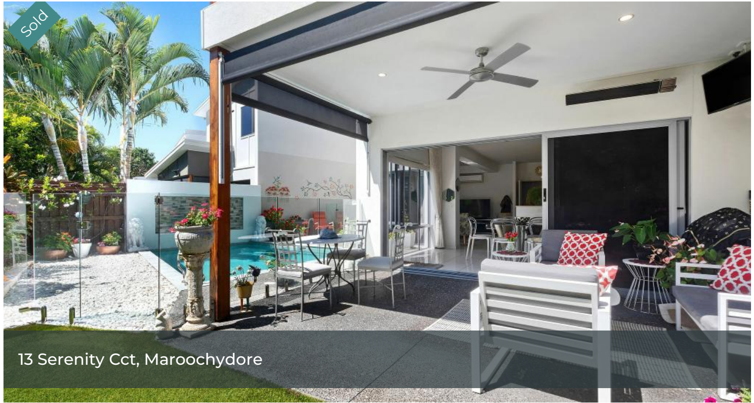
13 Serenity Cct, Maroochydore