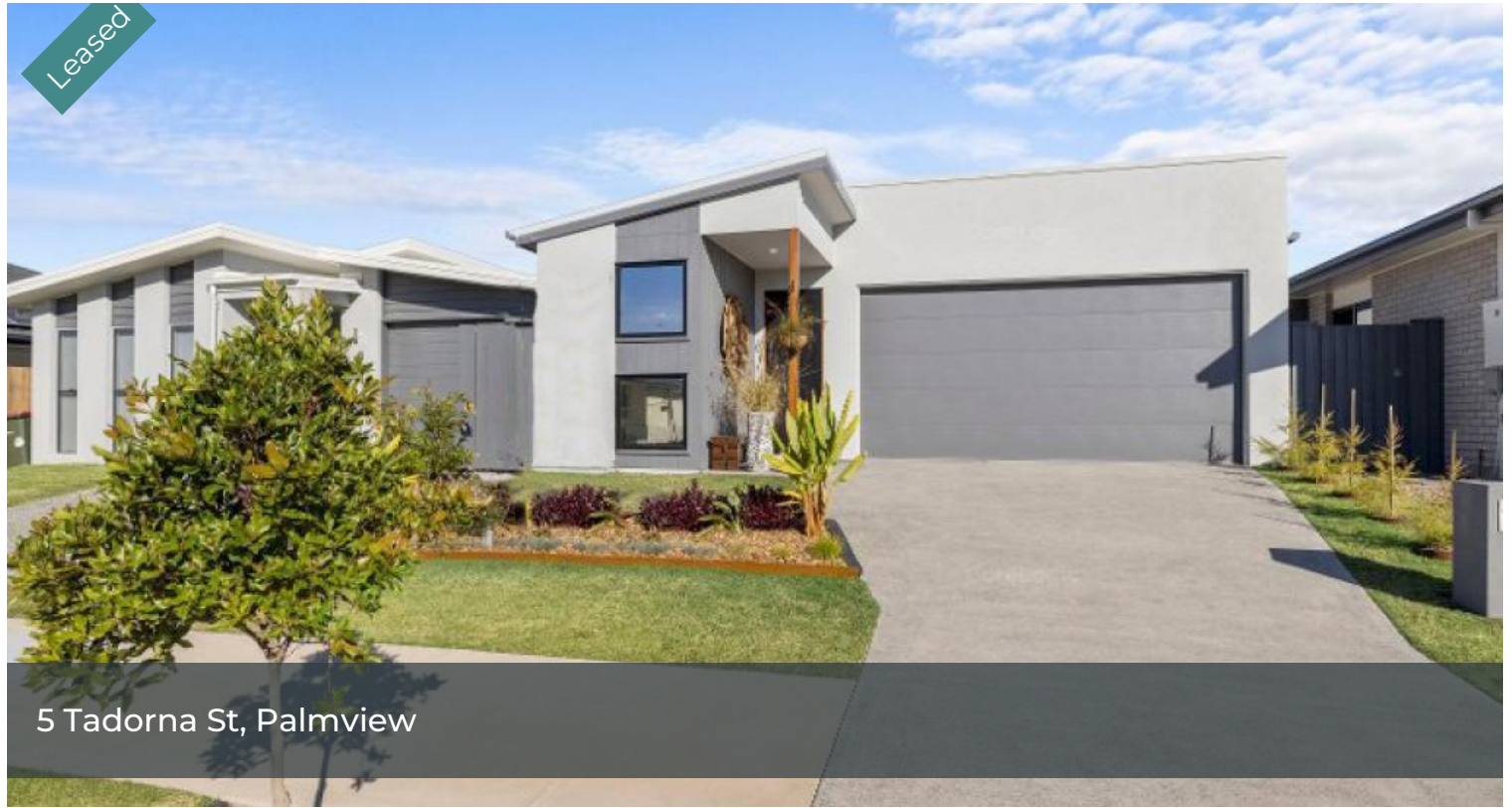
5 Tadorna St, Palmview