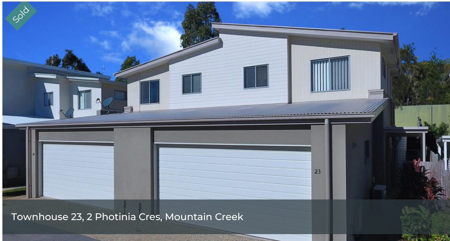
Townhouse 23, 2 Photinia Cres, Mountain Creek