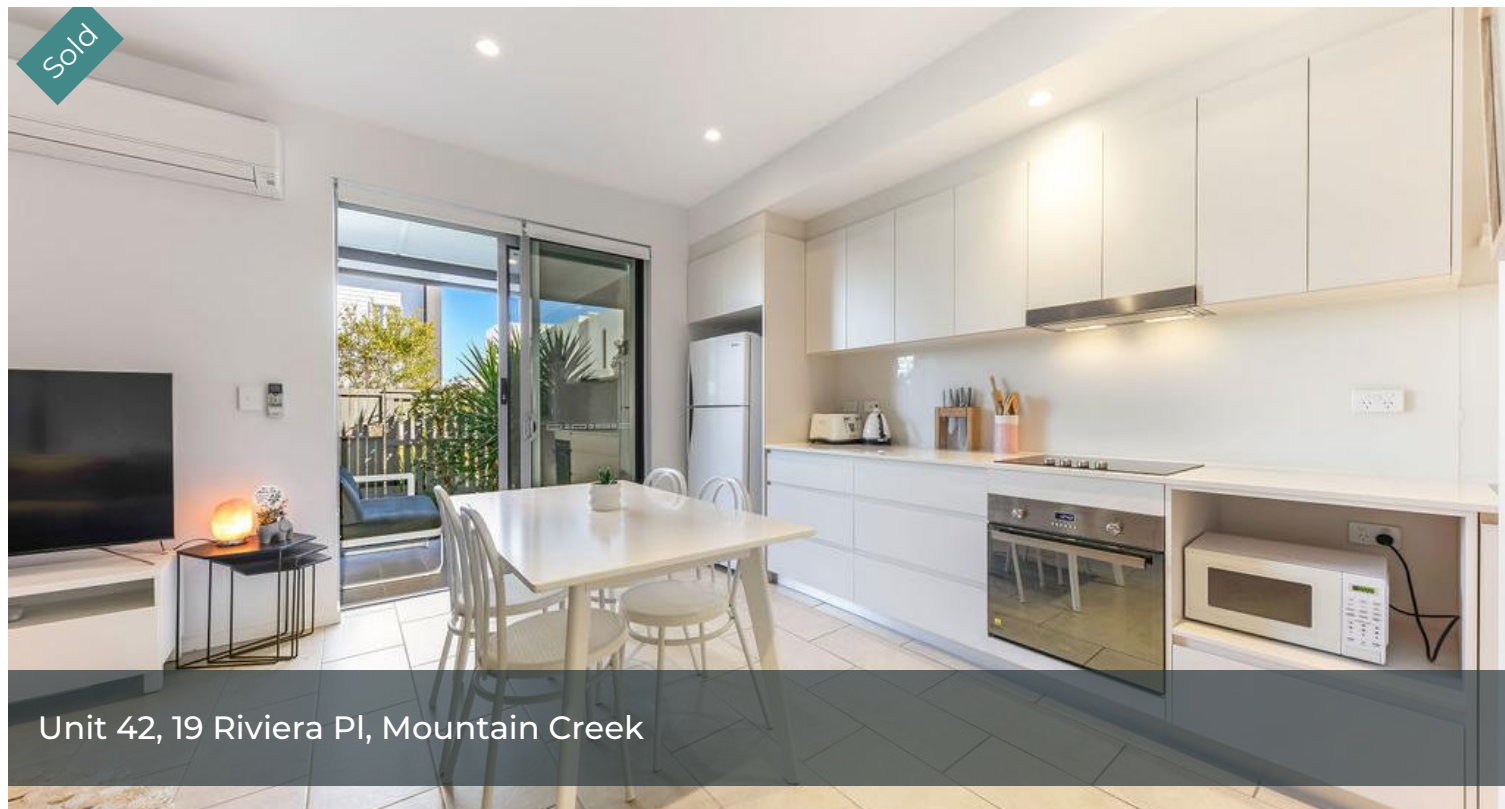
Unit 42, 19 Riviera Pl, Mountain Creek